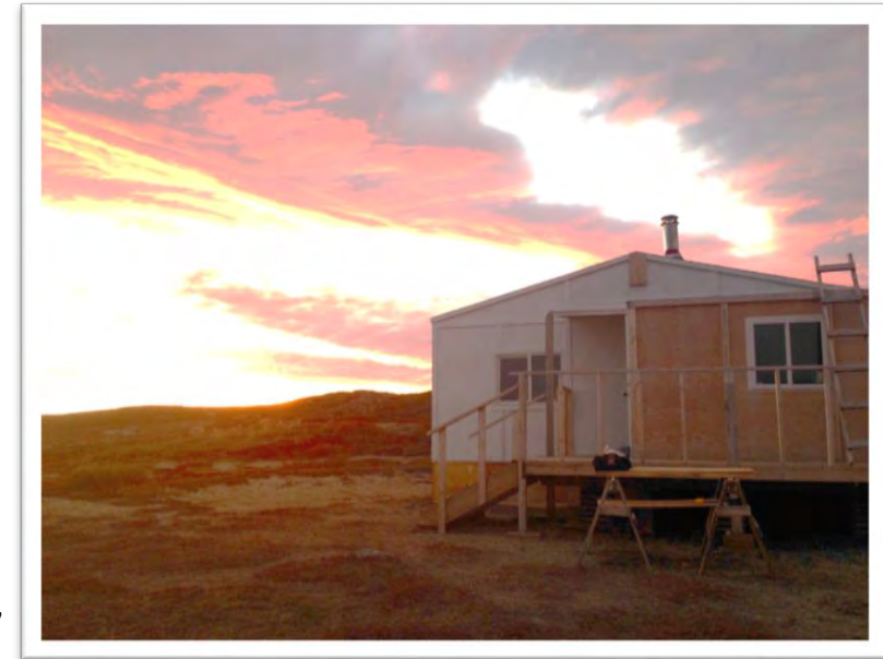
Fletcher Lake Cabin, Sept 2017